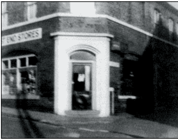
West End Stores

We used to put on our own concerts all the time, I particularly remember singing to "I'll be your sweetheart". When our parents weren't looking, we also used to climb onto the Crescent roof which was flat at the back. We got up there via a smaller wall which was part of the Methodist Church which also backed onto the yard. I used to find it a bit scary but it was a great feeling of achievement when I managed it. On nice sunny days we would often go to the Park or go tad-poling with our jam jars. I can't actually remember where we went to get tadpoles but I know we set off up Mill Hill and that we always hurried passed Dark Lane in case something dreadful happened to us!