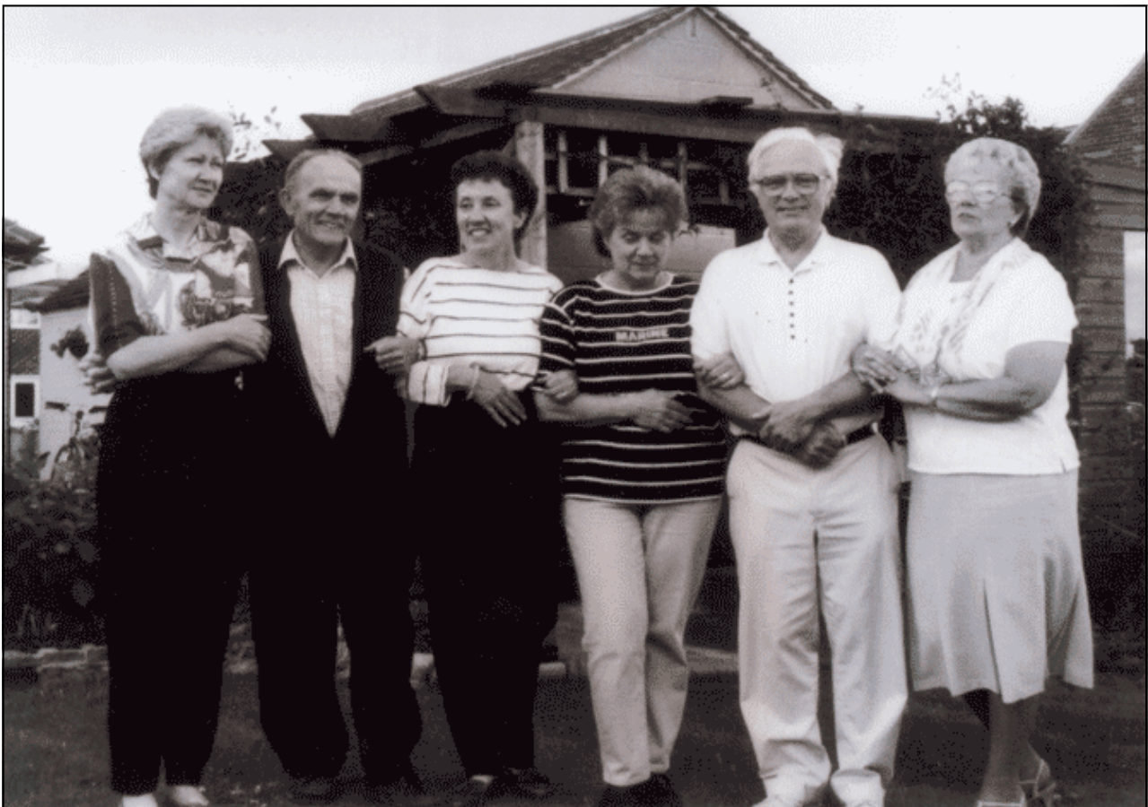
The Berry Siblings